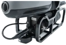
Medusa Radiometrics Medusa Radiometrics Gamma-Ray Sensor