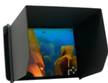
Blueye Robotics Sunshade Medium