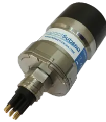
Impact Subsea ISS360 Sonar