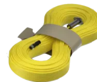
Blueye Robotics 150 m replacement tether