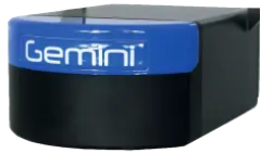
Tritech International Ltd Micron Gemini Multibeam Sonar