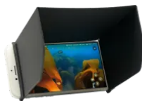
Blueye Robotics Sunshade Small