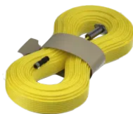
Blueye Robotics 75 m replacement tether