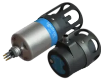
Blueprint Subsea SeaTrac USBL Positioning System