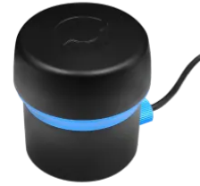
Blue Robotics Ping360 Scanning Imaging Sonar