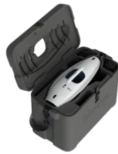
Blueye Robotics Light Transportation Case