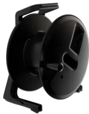
Blueye Robotics Blueye Tether Reel