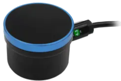
Blue Robotics Ping Sonar Altimeter and Echosounder