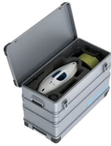
Blueye Robotics Aluminum Transportation Case