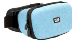
MovieMask MovieMask Premium Blueye edition