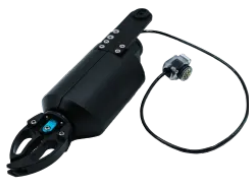
Blue Robotics Newton Subsea ROV Gripper / Blueye Quick Connect edition