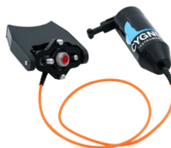
Cygnus Instruments Cygnus Ultrasonic Thickness Gauge